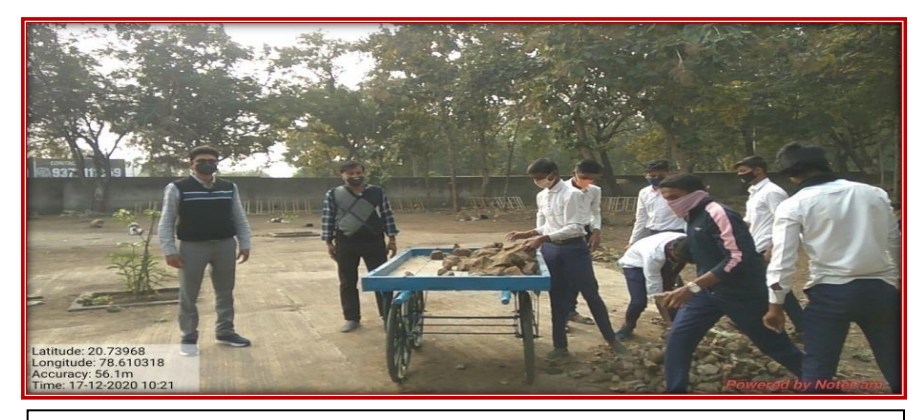
Students doing shramdaan

The beautification of campus started with the efforts of teaching, non-teaching staff and students who contributed largely to this task. As a part of this activity, the volunteers of NSS did shramadan and helped clean the campus of the college. The stones and boulders collected and properly arranged by them were later on coloured and this added to the beautification of the campus.