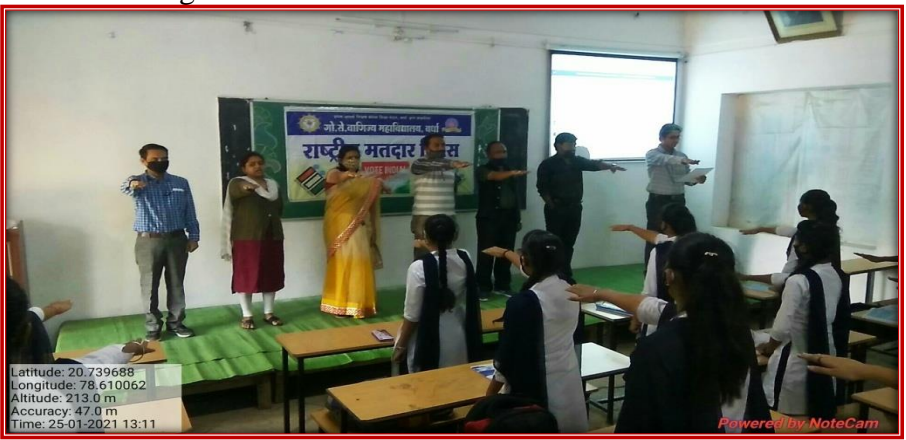
Voters awareness oath programme

The Voters Day was celebrated in the college and a programme to make students aware of the importance of right to vote in a democratic country like India was arranged. The students were also given the oath of voting on the occasion. The programme organised by Collector Office in which the District Collector Mr. Vivek Bhimanwar addressed the people. The programme was streamed on You Tube Live. The arrangement was made for the students so that they can attend it in the college itself.