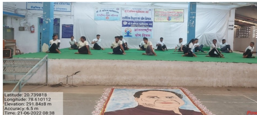
Yoga asanas being performed by teachers and students