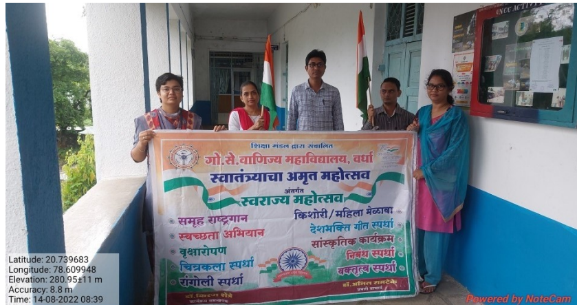
NSS faculties in Selfie with Tiranga activity

As per the directions of NSS, RTM Nagpur University, Nagpur, an activity 'Selfie with National Flag' was organised in which the NSS department faculty members participated. It was aimed at showing respect towards our National Flag as well as in memory of the national luminaries who martyred themselves in the great fight against British rule to free our nation from their slavery. The teachers paid their tributes to the founding fathers of India and remembered their tireless efforts and sacrifices on this occasion.