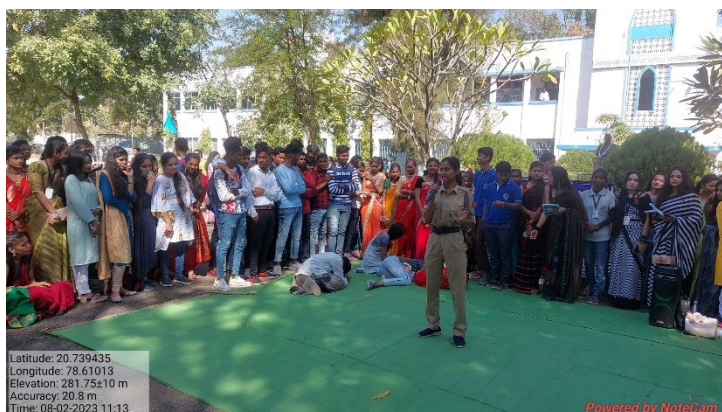
Drama being presented by volunteers

A street play was presented on the eve of annual day programme on the campus of the college. The play was aimed at making students sensitized towards road safety. The participants of the play successfully through their acting gave the message of road safety and traffic rules. They also made an appeal to the present audience to adhere to the rules to avoid any kind of casualties and behave like responsible citizens. The students witnessing the play took oath of following the rules of traffic in life. Total 10 students acted in the play.