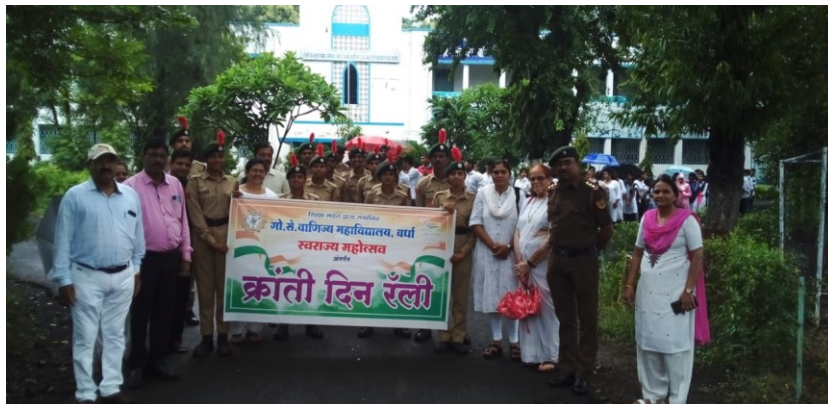
Faculty and students in the rally

August Kranti Day rally was organised by the college in honour of freedom fighters who accompanied Mahatma Gandhi in the struggle to free India from the shackles of slavery under British rule. The students from all departments, all teaching and non-teaching staff members participated in the rally which visited different areas of the city. The participants shouted slogans and gave a message of social harmony. The common people also joined the rally in various parts of Wardha.