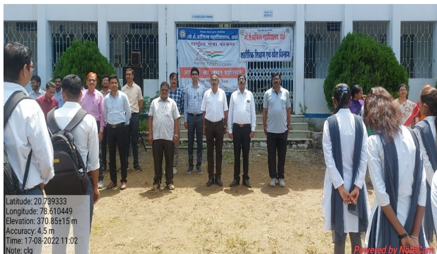
National anthem was played under Azadi ka Amrut Mahotsav