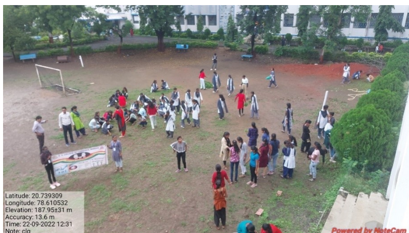
Cleanliness drive on the college campus

The department organised a cleanliness oath and activity on the campus of the college. A total of 94 volunteers participated in the drive and cleaned different pockets of the college including garden, ground, library, class rooms etc. The students were also motivated to keep their house and premises they live in clean so that we can collectively defeat the diseases arising out of dirty and unhygienic surroundings. The volunteers were also tasked with keeping an eye on the cleanliness of their respective classrooms and motivate other students for the same.