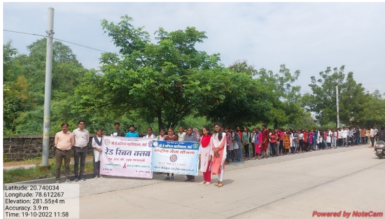
Volunteers in awareness rally

An awareness rally on HIV AIDS was carried out to bring awareness among the people. The volunteers gave the message through placards, slogans etc. The rally was taken out through different places of Wardha city. The volunteers also met people and requested them to be friendly with the people suffering from this disease. As they were already equipped with the information on the subject, they tried to clear the doubts of people regarding the same. A total of 90 students participated in the rally.