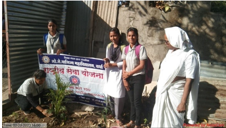
Volunteers planting saplings

Sapling plantation activity was carried out at the village Pawnar by 05 volunteers who planted three saplings in different areas of the village. The villagers also participated them in the activity. By this gesture of responsibility towards ecology, the volunteers gave a message of green and clean village to the villagers.