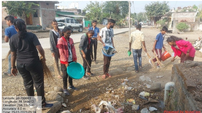
Volunteers cleaning the village

The cleanliness drive was carried out in the different areas of the village Salod. The volunteers not only cleaned the village but also gave a message of clean and green village to the villagers. An important aspect of the drive was that many villagers willingly joined the volunteers and promised to keep their areas clean always. The Sarpanch, deputy sarpanch and other members of Gram Panchayat appreciated the efforts of volunteers.