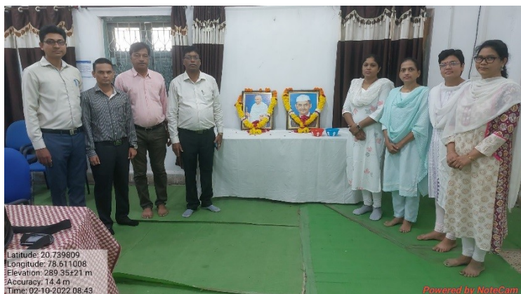
Great Leaders Mahatma Gandhi and Lal Bahadur Shastri Tributes