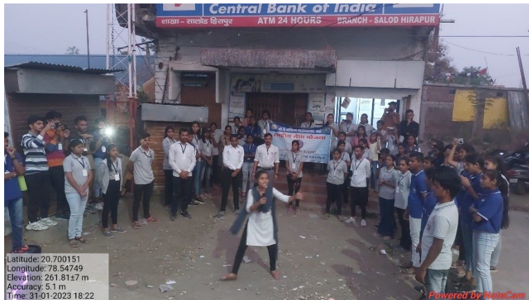
Volunteers gave a message of road safety through play

A street play on the theme of road safety was performed by volunteers in the village to give a message of following safety rules and avoid casualties being caused due to negligence of commuters towards traffic rules. The students through the play told the villagers the importance of wearing helmets. A large number of people were present for the play.