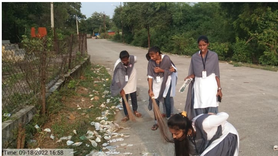
Volunteers in the drive

A cleanliness drive was conducted in the village Pavnar wherein six volunteers of the NSS department coming from the same village participated. They cleaned the areas near Vinoba Bhave ashram and gave a message of cleanliness to the villagers. As Pavnar is a tourist place due to serenity and pristine beauty of Dham river and rocks on the banks of the river, throwing litter anywhere has become a big problem. The drive also aimed at sensitizing the people coming there towards this issue.