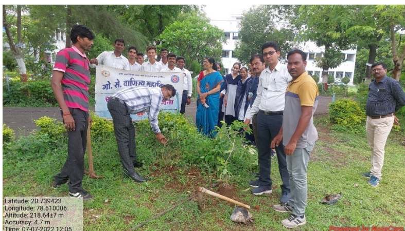
Sapling plantation on college campus

The NSS department gave a message of clean campus green campus through sapling plantation on the college campus. Every year in the beginning of monsoon, tree plantation drive is carried out by NSS department. As a part of this drive, the plants were planted in the premises of the college. The pattern was followed and volunteers were motivated to do the same throughout Wardha. Teaching, non-teaching faculty members and 12 students from senior and junior college participated in the activity.