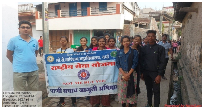
Teachers and volunteers in rally

It is a bare fact that the natural water bodies are shrinking, and availability of potable water has become a big challenge for human beings. To make this fact realise to students as well as villagers, a save water rally was carried out in the village with an appeal to the villagers to be aware about this and save water and do not pollute any of the water bodies such as rivers, wells, lakes, ponds etc in the village. The volunteers through slogans and meeting people in person tried to make them aware about scarce availability of drinking water if we keep polluting the water bodies.