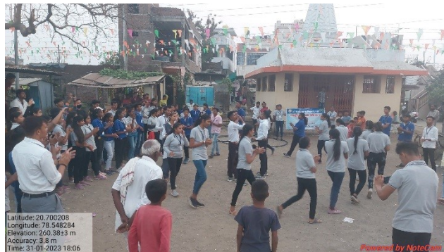
Volunteers' street play performance

The government has clamped blanket ban on liquor sale, consumption and production in Wardha district as it is well known as Gandhi district. Though it is true, some people clandestinely transport or manage to get liquor and consume it which is against the law. To make people aware of the ill effects of the liquor consumption, a street play was staged in the village. The volunteers through their skit presented the drama impactfully. Many villagers were present at the market place where the play was performed by the volunteers. The villagers especially women appreciated students for their efforts to sensitize people towards this very grave issue.