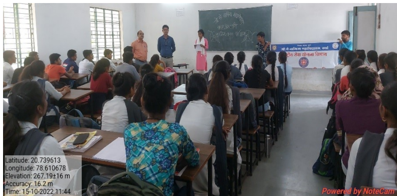
Vachan Prerana activity

Vachan Prerana Day was celebrated on the occasion of birth anniversary of Dr. APJ Abdul Kalam. In the activity, the students recited poems, read passages from text books, short stories etc. The faculty members from NSS department and Library department were present at the programme. A total of 47 volunteers were present at the event.