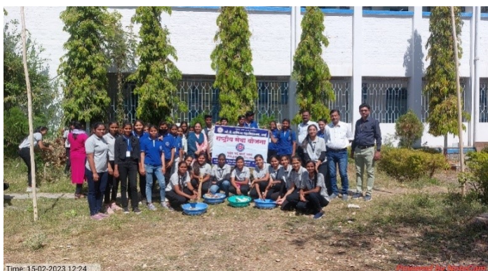
Volunteers in cleanliness activity

The volunteers participated in a cleanliness drive organised on the college campus by the department. They cleaned all the three gardens including the premises. A total of 104 volunteers very enthusiastically and joyously participated in the activity. Through this drive, they not only cleaned the campus but also gave a message of cleanliness to other students. They also took the oath that they would keep the premises and their respective classes always clean.