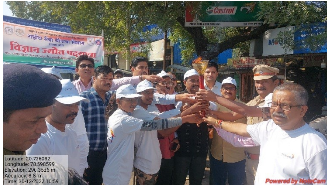
Vidyan Jyot Padyatra