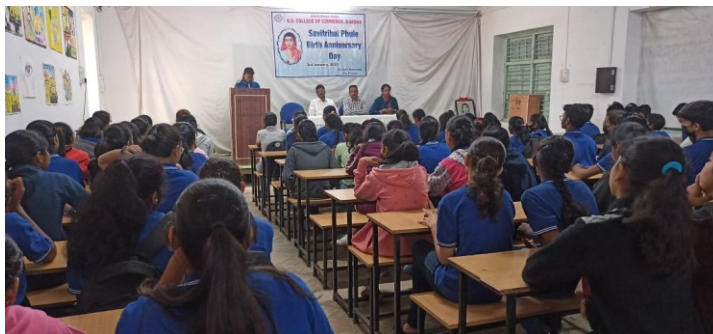
Vidyan Jyot Padyatra