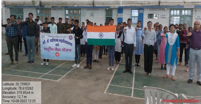
Volunteers taking oath of national unity and integrity

The oath of national unity and integrity was administered to students and teachers in a programme under Har Ghar Tiranga , an initiative of government of India, organised in college. The event was attended by 58 students and 07 faculty members of the NSS department. As the nation is celebrating 75 years of Independence, the programme was an important event to inculcate nationalistic spirit in the students and make them realise about their duties towards nation as the responsible citizens.