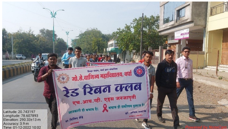
Volunteers in awareness rally