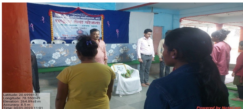
Tribute was paid to Mahatma Gandhi on his death anniversary