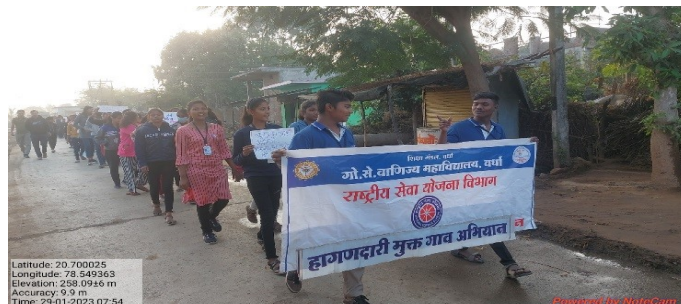
Volunteers in rally

Open defecation is a big problem throughout the country. Keeping in mind this very important issue, a rally was organised to make people aware about the ill effects of open defecation. The volunteers through slogans, placards and banners gave a message of cleanliness and by meeting people physically tried to tell them the importance of keeping village open defecation free. The volunteers got good response of villagers.