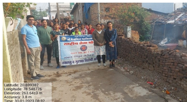
Rally in the village

Tobacco consumption is rampant across the region of Vidarbha and many youths are under the trap of this habit. As it contains deadly component of nicotine, it is very harmful to the health. It may also cause cancer if consumed for a longer time period. In realization of this fact, the department decided to make the youth of the village aware about tobacco's ill effects. The word was tried to spread through a rally which was carried out through different localities of the village. The volunteers through slogans, placards and banners tried to give a message of tobacco free village and youth being the messengers of this activity. The Sarpanch and other members of the Gram Panchayat applauded the efforts of volunteers. Some youth also joined the rally.