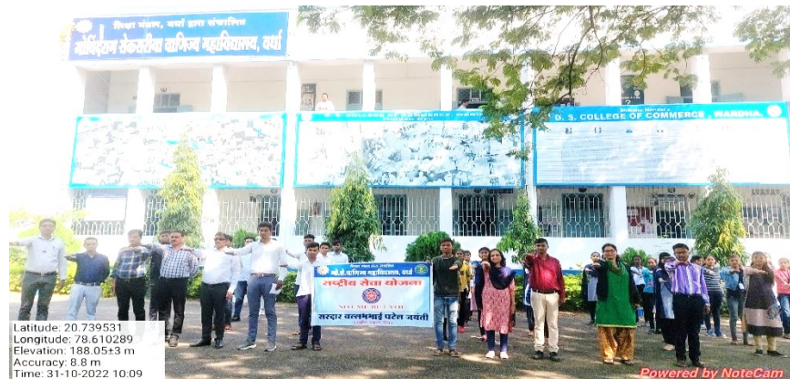
Oath taking programme