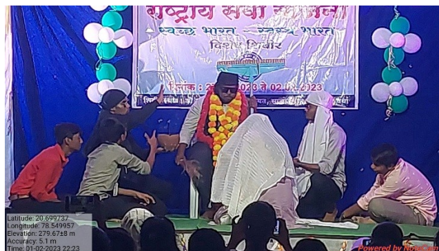
Drama on superstition eradication

Various performances were presented in the cultural programme of the camp. Solo and group dances, bhajans, bheemgeete, quawwalis, lavnis, drams, one act plays etc. were performed by the volunteers. Most of the plays were on the social themes through which they gave social message to the villagers present at the event. The enthusiasm and happiness of volunteers was quite apparent during the event.