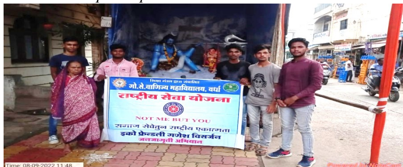
Volunteers in the drive

The volunteers gave a message of eco-friendly Ganapati immersion through an awareness activity. The increasing pollution has become a matter of concern and during popular festivals, this problem aggravates. Keeping in mind the immersion of Ganesh idols in natural water bodies, the NSS department decided to make people aware as well as sensitized towards this grave problem. The volunteers visited different pandals and requested the managements of the concerned pandals to immerse the idols only government provided artificial water tanks and keep the city clean. Total 10 volunteers participated in the drive.