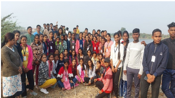
Volunteers did shramdan at the lake site

A visit to the Salod Lake was arranged by the organisers of the camp keeping in mind to sensitize students towards natural water bodies and their importance in our life. Through this visit to the lake, the students were given information about the history of the lake. They were made acquainted with the fact that even today, the villagers use the water of the lake for different purposes. As the water bodies are shrinking due to ignorance and ill acts of human beings, we need to not only desilt but conserve them for our own future as well as ecological balance. The students were given a task to clean the surrounding area of the lake and involved in shramdan there as a part of their daily camp activity.