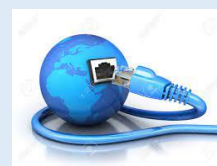
High Speed Internet ICT Centre