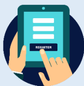
Online Admission Process

In the Gymkhana, there is a well-equipped indoor hall for the development of students' sports skills and fitness to help the students participate in national and international competitions. To date, many of our students achieved success in various national and international competitions. The College has a facility of a Girls' Hostel with a capacity of 50 students and for girls. A residential facility is also provided by the college for teaching staff- 02 blocks and non-teaching staff - 03 blocks. The entire infrastructure is under CCTV surveillance.