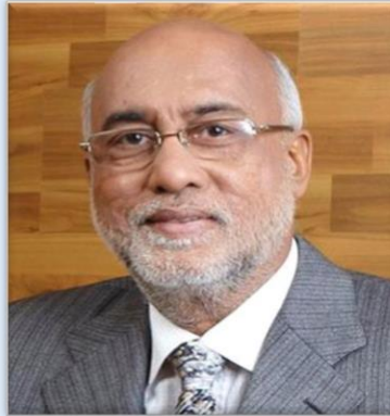
Shri. Shekhar Bajaj President & Trustee