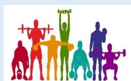
Health Club (Gymnasium)