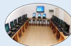
Well Furnished Computer Lab