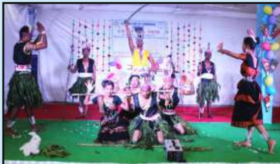
Tribal Dance Performance in G S Stars