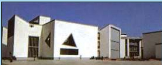
Bajaj Institute of Technology, Pipri (Wardha)