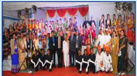
NAAC Peer Team Visit to the College (17-18 January 2020)