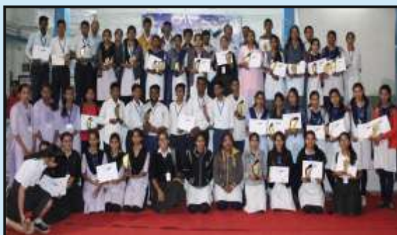
Winners of different competition under UDAAN