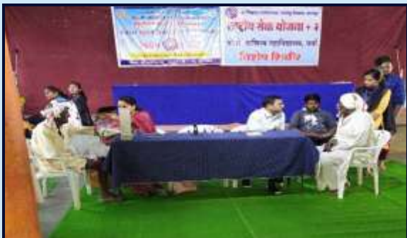
Health check-up and medicine distribution camp at Salod (H)