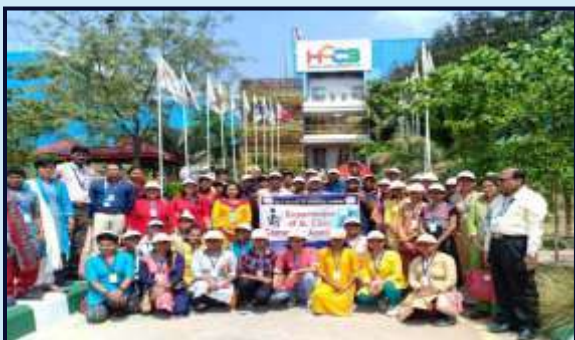
Industrial Visit at HCCB, Hyderabad