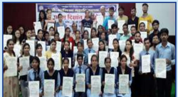
First Convocation Ceremony at College 2018