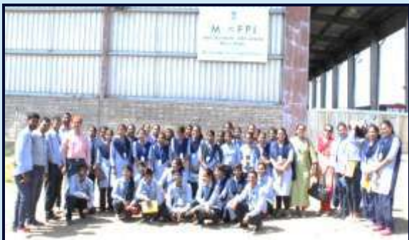
Industrial Visit at Agro Products Company, Sindhi Vihiri