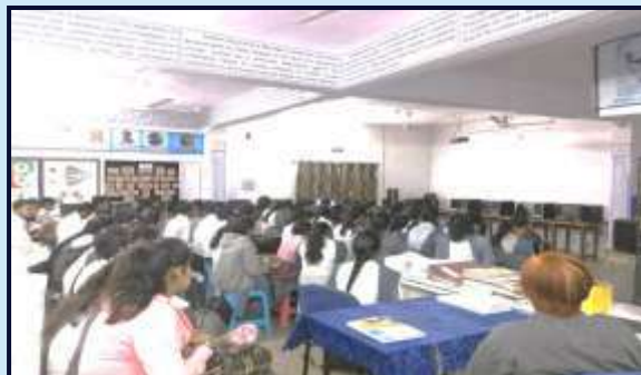
Live Streaming of General Budget Session 2019-20