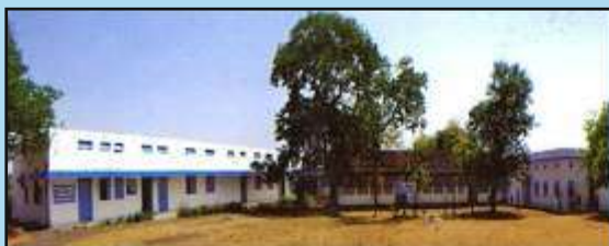
Department of Advance Management Studies (MBA)

Cambridge Assessment Certificate Course in English