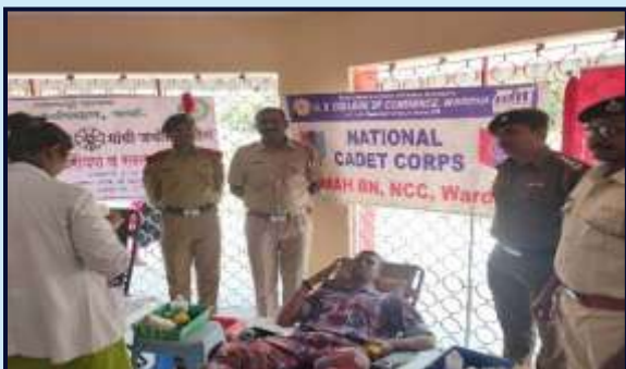
Blood Donation Camp organized collaboratively by Forest Dept, Wardha & GSCC, Wardha