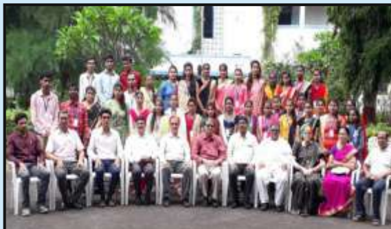
A group photo of students and teachers on the occasion of Teachers Day