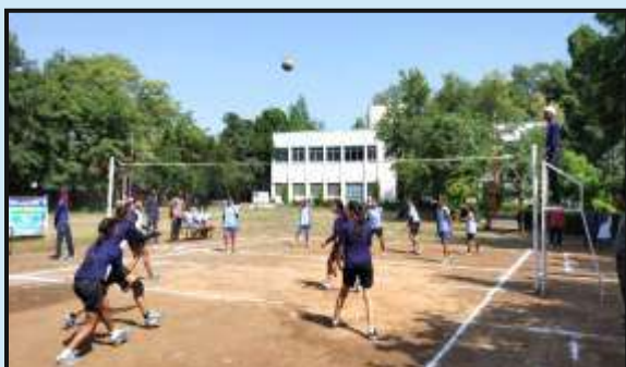
University Level Volley ball Tournament