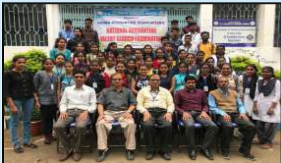
National Accounting Talent Search Examination