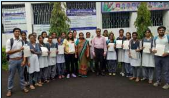
Distribution of BEC (Cambridge Council) Certificates