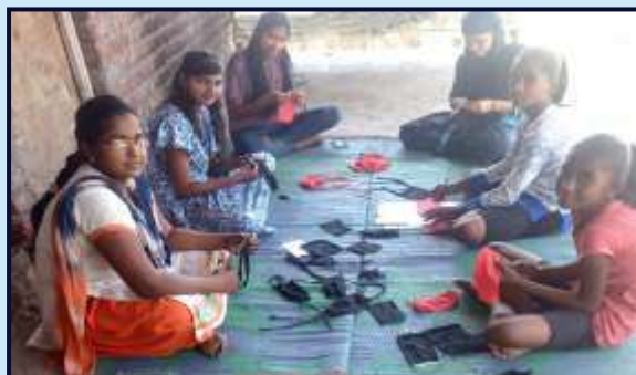
Volunteers made masks, sanitizers etc and distributed to villagers during COVID-19 pandemic