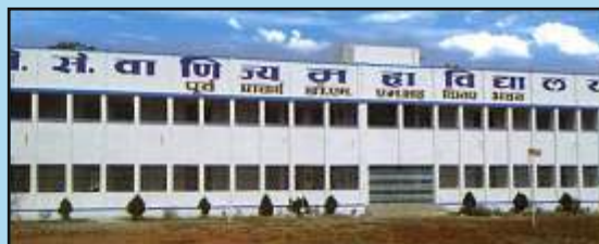
Dr. M. M. Shah Extension Bhavan