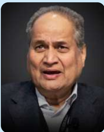
Shri. Rahul Bajaj President & Trustee