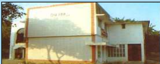
Shiksha Mandal Office, Wardha