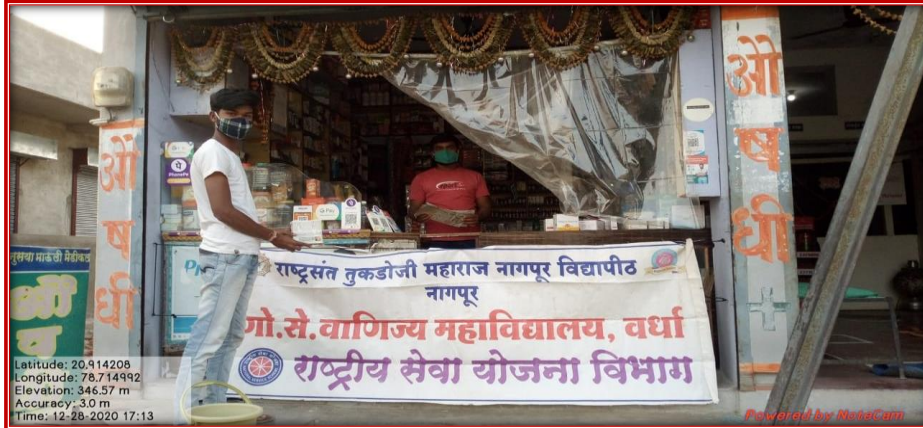
NSS volunteer distributing paper bags to shopkeepers