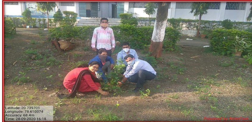
Sapling plantation activity on the campus of the college