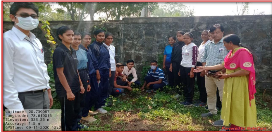
Sapling plantation in college and nearby areas

The sapling plantation drive was carried out in the college by NSS, Sports and NCC students collaboratively. They planted the saplings on the campus of the college as well as nearby areas and gave the message of green campus-clean campus. The teaching and non-teaching faculty members also assisted the volunteers in this social task. The drive was successfully conducted under the guidance of Principal Dr.Sahebrao Chavan.