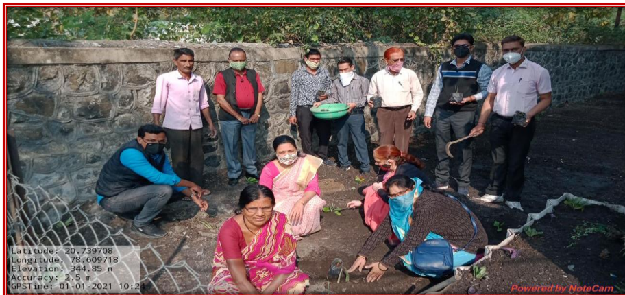
Sapling plantation in Herbal Garden in the college campus

The New Year was welcomed with zeal and enthusiasm by laying foundation of creation of a beautiful Herbal Garden by teaching fraternity of the college. The novel idea of Herbal Garden was translated into reality by planting a number of herbal and Ayurvedic saplings such as nim , tulsi , khanduchakka , ritha , turmeric , birda , ginger , akkal kadha , lendipinpari , pankuti etc. The Principal, teaching and non-teaching staff members contributed to this project.