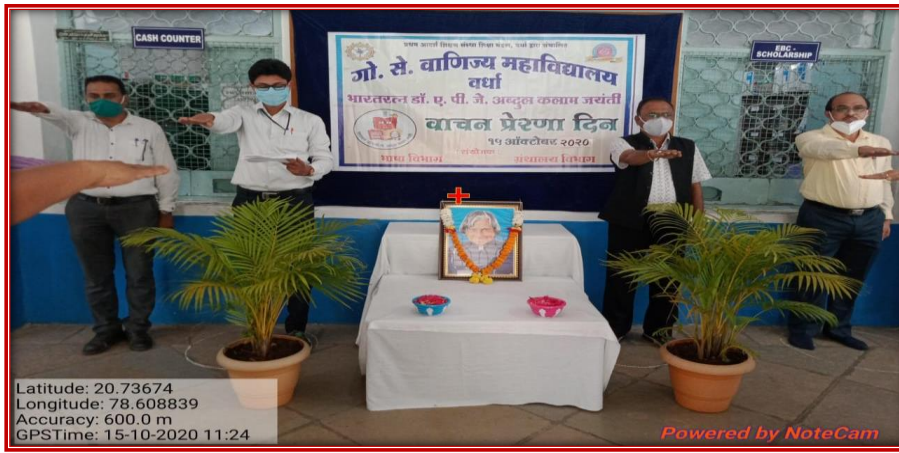
VachanPrerana Day Celebration