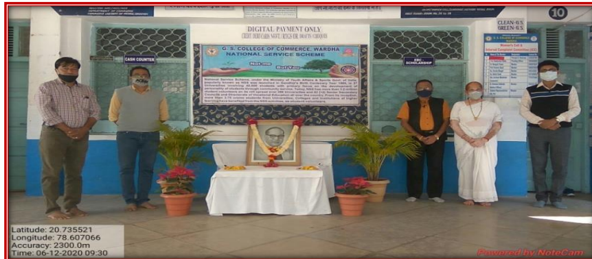
Staff and students paid homage to Dr. Babasaheb Ambedkar