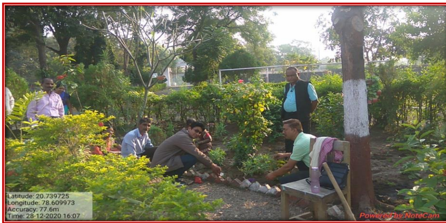
Sapling plantation in garden