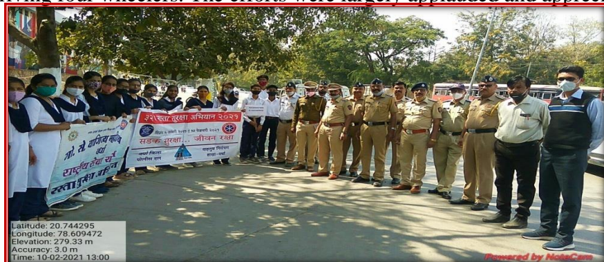
Road Safety Awareness Programme at Wardha