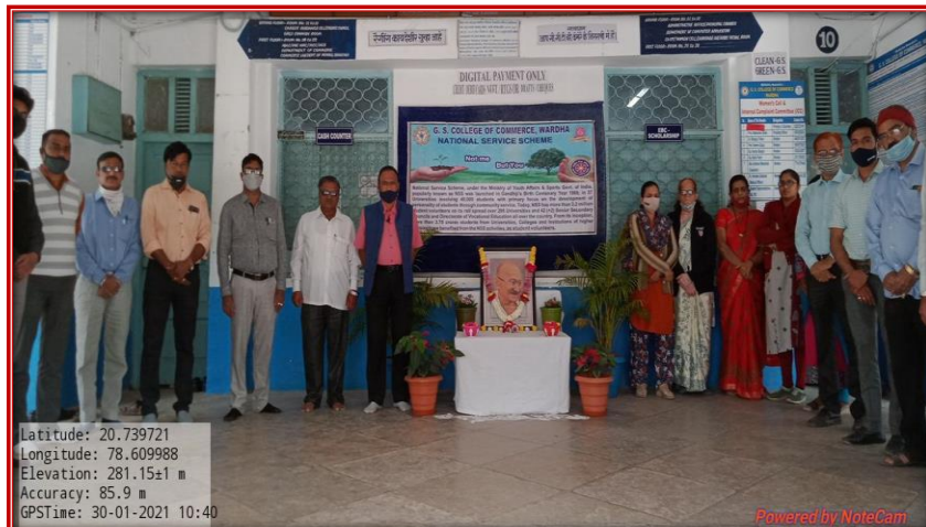
Mahatma Gandhi Death Anniversary Program