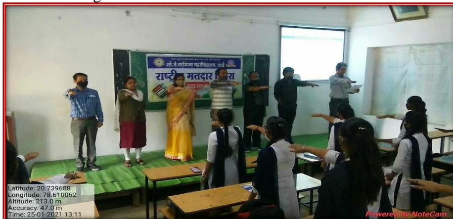
Voters awareness oath programme

The Voters Day was celebrated in the college and a programme to make students aware of the importance of right to vote in a democratic country like India was arranged. The students were also given the oath of voting on the occasion. The programme organised by Collector Office in which the District Collector Mr. Vivek Bhimanwar addressed the people. The programme was streamed on You Tube Live. The arrangement was made for the students so that they can attend it in the college itself.