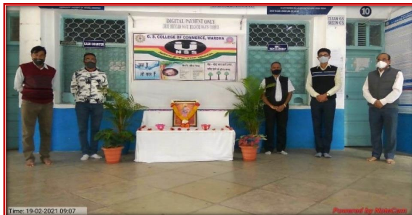
Chatrapati Shivaji Maharaj Birth Anniversary was celebrated in college