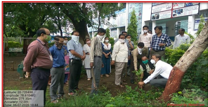
Staff members planting saplings