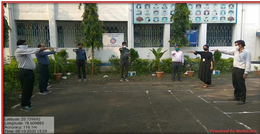
Teaching staff taking oath of Covid awareness