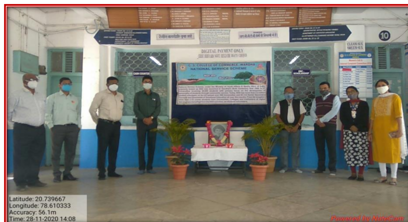
Staff and students paid tribute to Mahatma Fule