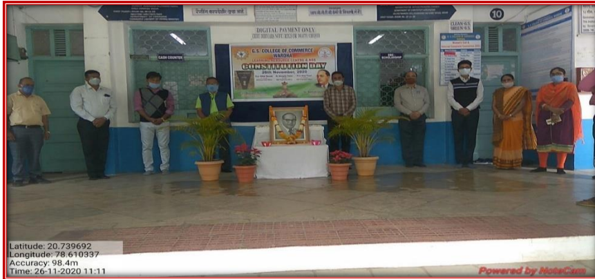
Indian Constitution Day Programme