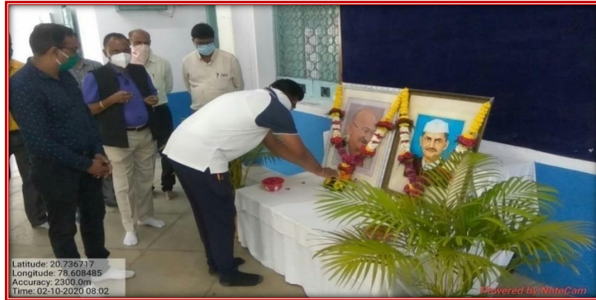
Staff members paying tribute to Gndhiji and Shastriji