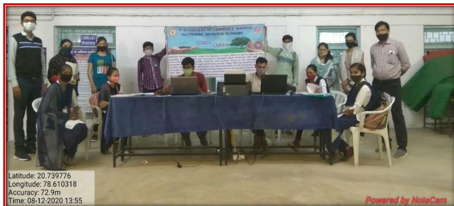
Aadhar Update Camp in the college