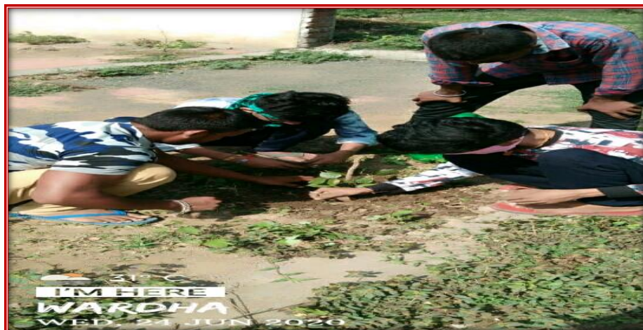
Volunteers planting saplings

The volunteers of NSS initiated a plantation drive in the historically important village Pawnar of Wardha District. They planted the saplings in the area of Dham river and contributed towards their social responsibility of conservation of Nature. In the same way, they also gave a message of Clean Wardha – Green Wardha through this significant move.