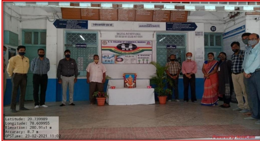
College paid tribute to Sant Gadge Baba