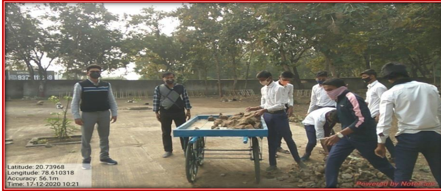
Students doing shramadaan

The beautification of campus started with the efforts of teaching, non-teaching staff and students who contributed largely to this task. As a part of this activity, the volunteers of NSS did shramadan and helped clean the campus of the college. The stones and boulders collected and properly arranged by them were later on coloured and this added to the beautification of the campus.