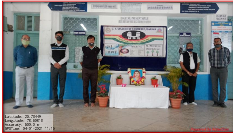
Savitribai Fule Birth Anniversary celebration

The college celebrated Savitribai Fule birth anniversary on 3 rd January. Savitribai Fule was the pioneer of women education in India and first woman teacher of modern India. The Principal talked on the contribution made by Savitribai Fule towards women education and emphasised that the girls and women of the country should follow the path paved by her. All the teaching and non-teaching staff members were present on the occasion.