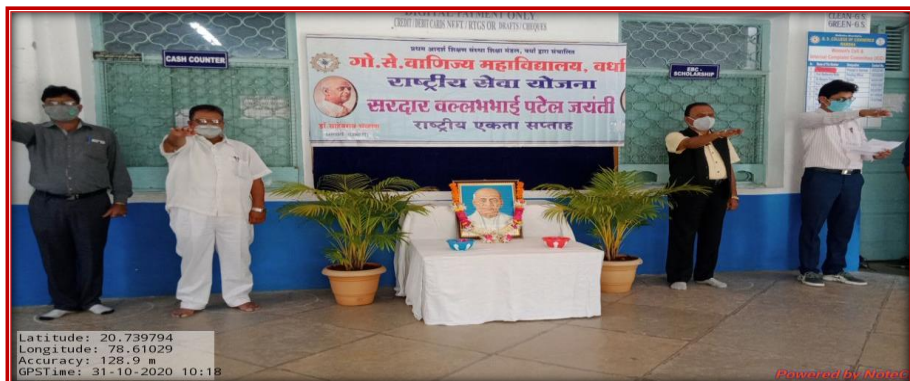
Staff and students taking the oath of National Unity