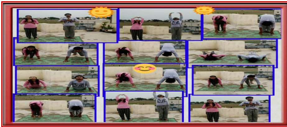
Volunteers doing yogasanas at their places