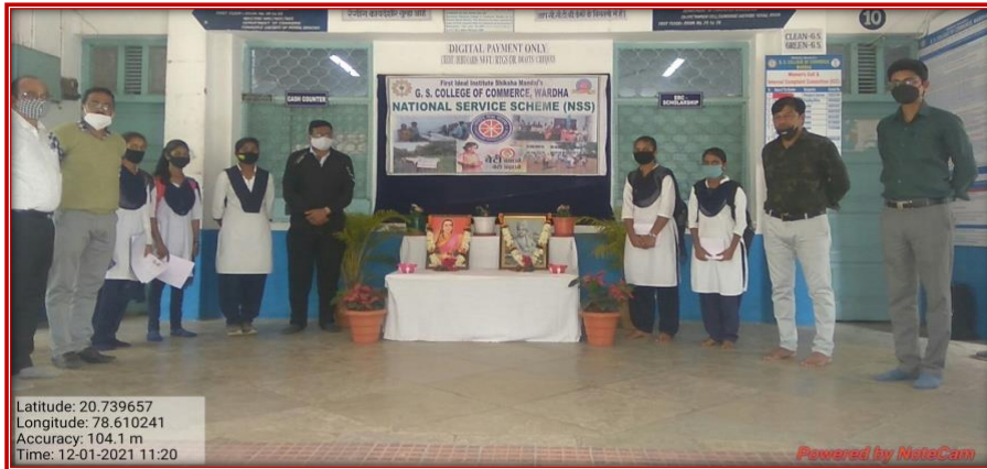
Teachers and students on the occasion of birth anniversaries of Jijamata and Swami Vivekananda