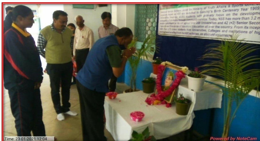
Netaji Subhash Chandra Jayanti programme