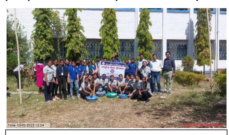
Volunteers in cleanliness activity

The volunteers participated in a cleanliness drive organised on the college campus by the department. They cleaned all the three gardens including the premises. A total of 104 volunteers very enthusiastically and joyously participated in the activity. Through this drive, they not only cleaned the campus but also gave a message of cleanliness to other students. They also took the oath that they would keep the premises and their respective classes always clean.