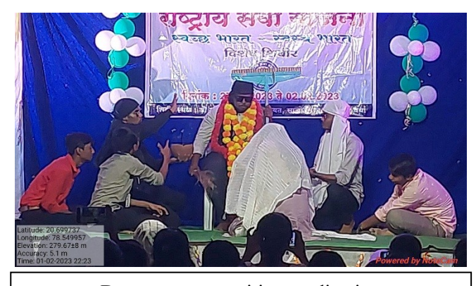
Drama on superstition eradication

Various performances were presented in the cultural programme of the camp. Solo and group dances, bhajans, bheemgeete, quawwalis, lavnis, drams, one act plays etc. were performed by the volunteers. Most of the plays were on the social themes throughwhich they gave social message to the villagers present at the event. The enthusiasm and happiness of volunteers was quite apparent during the event.