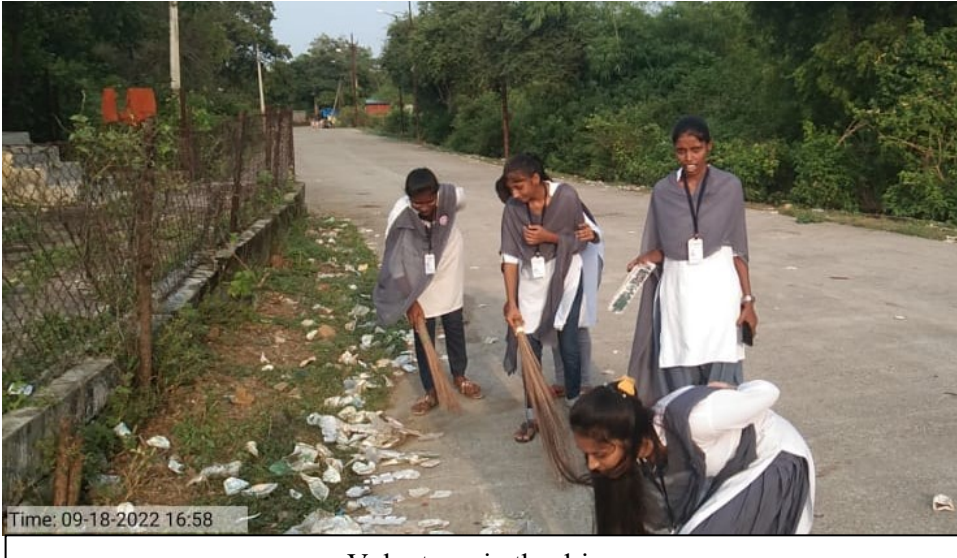
Volunteers in the drive

A cleanliness drive was conducted in the village Pavnar wherein six volunteers of the NSS department coming from the same village participated. They cleaned the areas near Vinoba Bhave ashram and gave a message of cleanliness to the villagers. As Pawnar is a tourist place due to serenity and pristine beauty of Dham river and rocks on the banks of the river, throwing litter anywhere has become a big problem. The drive also aimed at sensitizing the people coming there towards this issue.