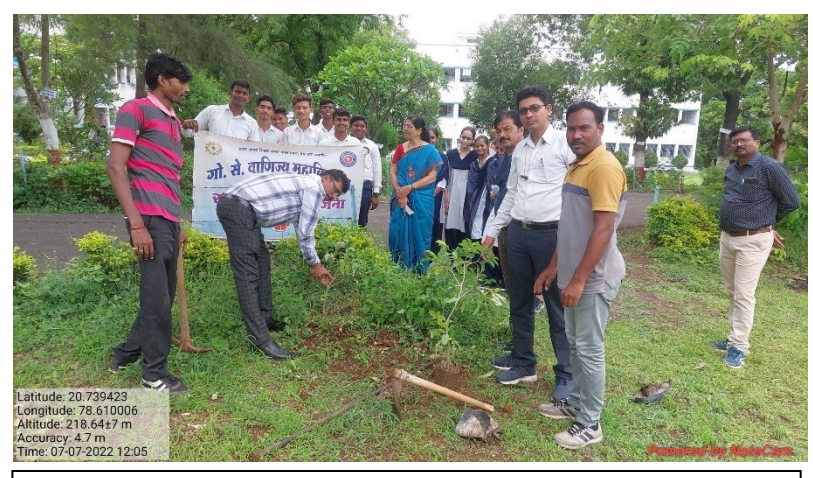
Sapling plantation on college campus

The NSS department gave a message of clean campus green campus through sapling plantation on the college campus. Every year in the beginning of monsoon, tree plantation drive is carried out by NSS department. As a part of this drive, the plants were planted in the premises of the college. The pattern was followed and volunteers were motivated to do the same throughout Wardha. Teaching, non-teaching faculty members and 12 students from senior and junior college participated in the activity.