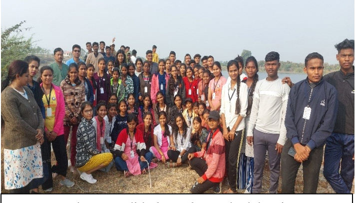
Volunteers did shramdan at the lake site

A visit to the Salod Lake was arranged by the organisers of the camp keeping in mind to sensitize students towards natural water bodies and their importance in our life. Through this visit to the lake, the students were given information about the history of the lake. They were made acquainted with the fact that even today, the villagers use the water of the lake for different purposes. As the water bodies are shrinking due to ignorance and ill acts of human beings, we need to not only desilt but conserve them for our own future as well as ecological balance. The students were given a task to clean the surrounding area of the lake and involved in shramdan there as a part of their daily camp activity.