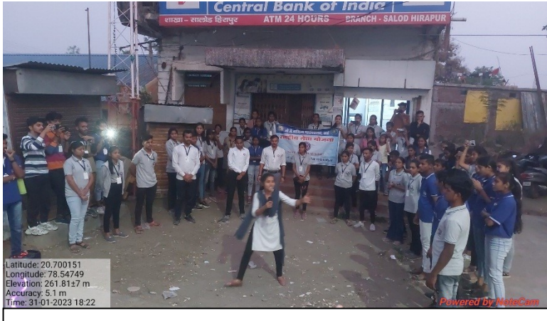
Volunteers gave a message of road safety through play

A street play on the theme of road safety was performed by volunteers in the village to give a message of following safety rules and avoid casualties being caused due to negligence of commuters towards traffic rules. The students through the play told the villagers the importance of wearing helmets. A large number of people were present for the play.