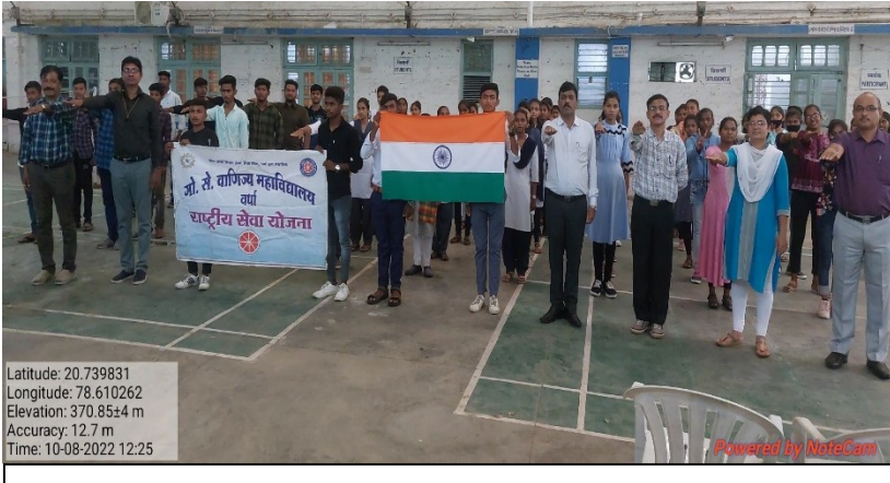
Volunteers taking oath of national unity and integrity

The oath of national unity and integrity was administered to students and teachers in a programme under Har Ghar Tiranga , aninitiative of government of India, organised in college. The event was attended by 58 students and 07 faculty members of the NSS department. As the nation is celebrating 75 years of Independence, the programme was an important event to inculcate nationalistic spirit in the students and make them realise about their duties towards nation as the responsible citizens.