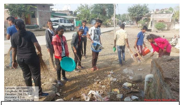
Volunteers cleaning the village

The cleanliness drive was carried out in the different areas of the village Salod. The volunteers not only cleaned the village but also gave a message of clean and green village to the villagers. An important aspect of the drive was that many villagers willingly joined the volunteers and promised to keep their areas clean always. The Sarpanch, deputy sarpanch and other members of Gram Panchayat appreciated the efforts of volunteers.