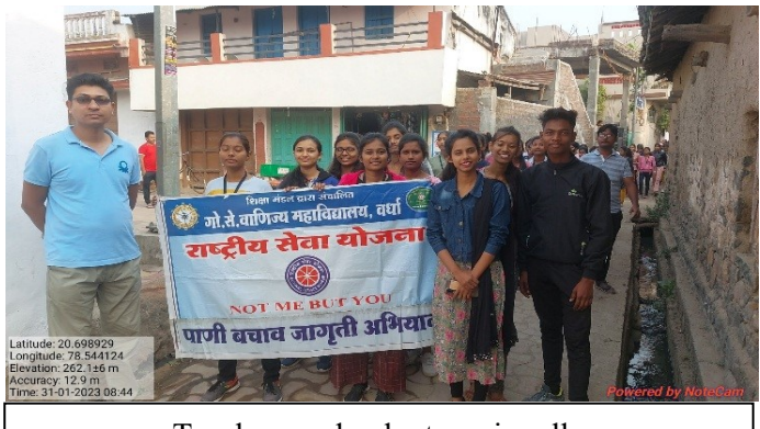
Teachers and volunteers in rally

It is a bare fact that the natural water bodies are shrinking, and availability of potable water has become a big challenge for human beings. To make this fact realise to students as well as villagers, a save water rally was carried out in the village with an appeal to the villagers to be aware about this and save water and do not pollute any of the water bodies such as rivers, wells, lakes, ponds etc in the village. The volunteers through slogans and meeting people in person tried to make them aware about scarce availability of drinking water if we keep polluting the water bodies.