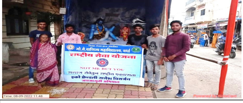
Volunteers in the drive

The volunteers gave a message of eco-friendly Ganpati immersion through an awareness activity. The increasing pollution has become a matter of concern and during popular festivals, this problem aggravates. Keeping in mind the immersion of Ganesh idols in natural water bodies, the NSS department decided to make people aware as well as sensitize towards this grave problem. The volunteers visited different pandals and requested the managements of the concerned pandals to immerse the idols only government provided artificial water tanks and keep the city clean. Total 10 volunteers participated in the drive .