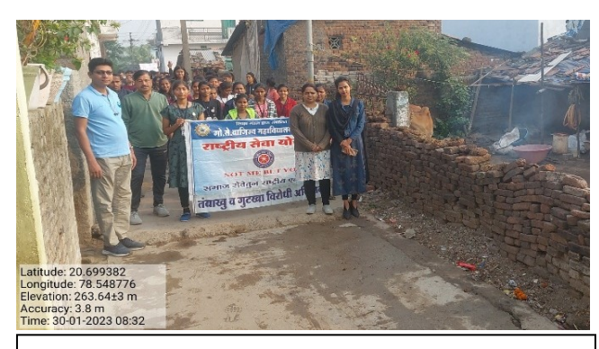
Rally in the village

Tobacco consumption is rampant across the region of Vidarbha and many youths are under the trap of this habit. As it contains deadly component of nicotine, it is very harmful to the health. It may also cause cancer if consumed for a longer time period. In realization of this fact, the department decided to make the youth of the village aware about tobacco's ill effects. The word was tried to spread through a rally which was carried out through different localities of the village. The volunteers through slogans, placards and banners tried to gave a message of tobacco free village and youth being the messengers of this activity. The Sarpanch and other members of the Gram Panchayat applauded the efforts of volunteers. Some youth also joined the rally.