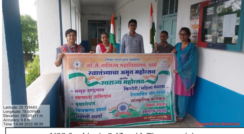
NSS faculties in Selfie with Tiranga activity

As per the directions of NSS, RTM Nagpur University, Nagpur, an activity 'Selfie with National Flag' was organised in which the NSS department faculty members participated. It was aimed at showing respect towards our National Flag as well as in memory of the national luminaries who martyred themselves in the great fight against British rule to free our nation from their slavery. The teachers paid their tributes to the founding fathers of India and remembered their tireless efforts and sacrifices on this occasion.