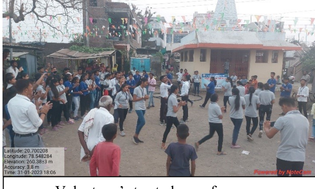
Volunteers' street play performance

The government has clamped blanket ban on liquor sale, consumption and production in Wardha district as it is well known as Gandhi district. Though it is true, some people clandestinely transport or manage to get liquor and consume it which is against the law. To make people aware of the ill effects of the liquor consumption, a street play was staged in the village. The volunteers through their skit presented the drama impactfully. Many villagers were present at the market place where the play was performed by the volunteers. The villagers especially women appreciated students for their efforts to sensitize people towards this very grave issue.