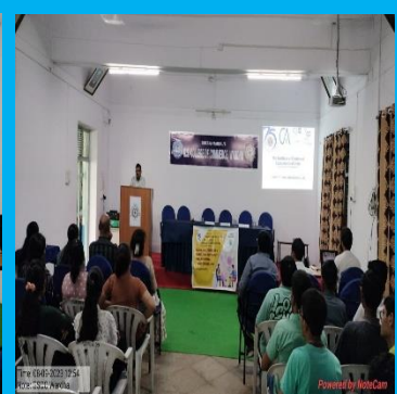
Inauguration of CA Study Circle