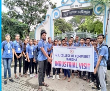
Industrial visit to Shivam Foods Parle Industries, Nagpur