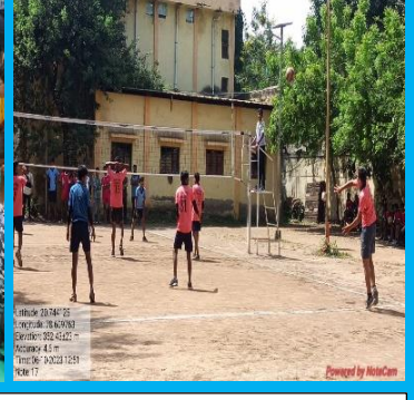
Various Sports Comeptition organized by District Sport Office, Wardha