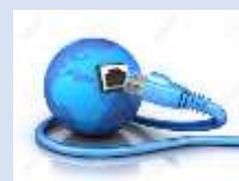
High Speed Internet ICT Centre