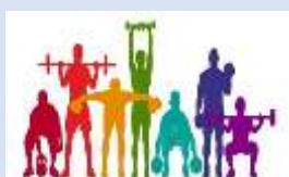
Health Club (Gymnasium)