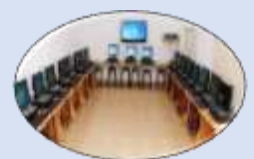
Well Furnished Computer Lab