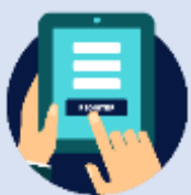
Online Admission Process

In the Gymkhana, there is a well-equipped indoor hall for the development of students' sports skills and fitness to help the students participate in national and international competitions. To date, many of our students achieved success in various national and international competitions. The College has a facility of a Girls' Hostel with a capacity of 50 students. A residential facility is also provided by the college for teaching staff- 02 blocks and non-teaching staff - 03 blocks. The entire infrastructure is under CCTV surveillance.